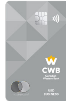
CWB Echelon Rewards+ Business™ Mastercard®